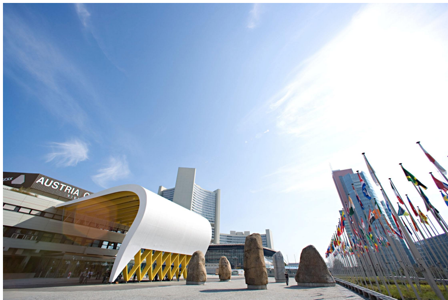
Figure 1: Austria Center Vienna, outside view, UN-buildings in the background